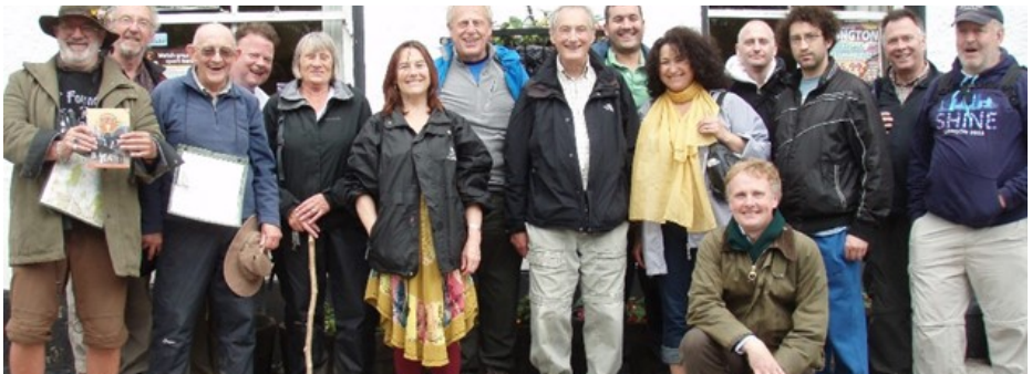
Bromley Cramble ramblers 2014 enjoying a well-earned break!

Pubs: At least three, including the Greyhound in Keston