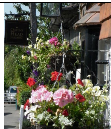
Queen's Head, Downe

Please read the Bromley Pub Walks introductory notes for explanation about information provided in these walking guides