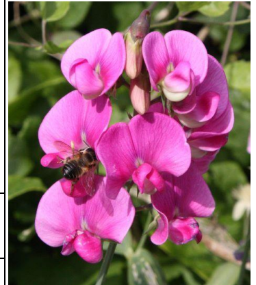
Lathyrus Latifolius next to Platform 2 at Chelsfield Station.