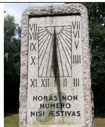
The William Willett Memorial

The Bromley Pub Walk guides have been prepared and published by Bromley CAMRA to encourage members and others to enjoy walking in the rural areas of Bromley and to visit the many pubs and clubs on the routes.