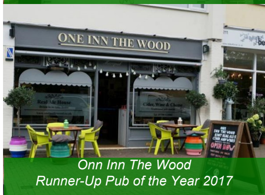
One Inn The Wood Runner-Up Pub of the Year 2017

All you need is your CAMRA membership number and an opinion on the beer you're drinking. Your favourite pub could be next year's Pub of the Year!