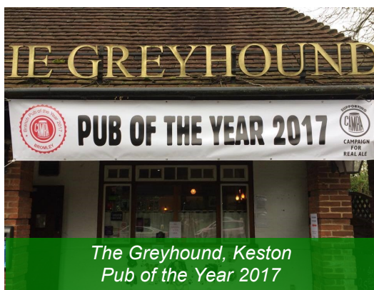
The Greyhound, Keston Pub of the Year 2017