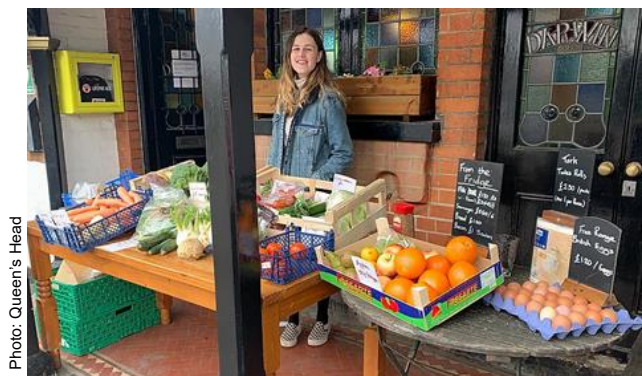
Queen's Head, Downe

Despite the very short timescale required to meet CAMRA's deadline, many members submitted their suggestions, which were then reviewed by the branch committee. The Committee decided that twelve venues deserved to be awarded the title of Lockdown Hero . In addition, the Queen's Head Downe, was given the Outstanding Lockdown Hero award.