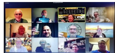
The Branch Committee meet via Zoom

In spite of it being a terrible year for the industry, pubs and general campaigning, as I review this past year there are some positive highlights I can write about. Overall, Branch activities have been proceeding with their usual vigour during the coronavirus restrictions. Although branch social activities are effectively banned, we have maintained our monthly committee meetings by using virtual methods and they have been well attended.