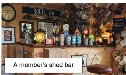
A member's shed bar

Our activities relating to the Good Beer Guide (GBG) and Pub/Club of the Year (PotY/CotY) have continued apace. The planned formal presentations for our 2020 Branch PotY & CotY had to be aborted due to Lockdown, but the framed certificates were handed personally to the venues. In spite of restricted pub access, branch members have been submitting beer scores in sufficient numbers and it's now looking like more than 30 of our pubs and clubs are likely to be eligible for consideration for GBG 2022.