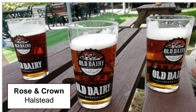
Rose & Crown Halstead

Routes 25 , 50 and 51 can be linked together to form a car-free 4.5 mile walk from Knockholt Station. The R5 / R10 bus also serves both villages.