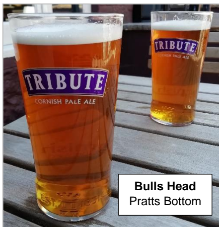
Bulls Head Pratts Bottom

As reported in the June issue of the e-Newsletter, during 2021 new routes are being added to the list of Bromley Pub Walk guides. There are now six routes which 'cross the border' into Kent.