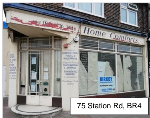
75 Station Rd, BR4

(And, for the Editor, this new pub will be just a few stops away on the 194 bus...)