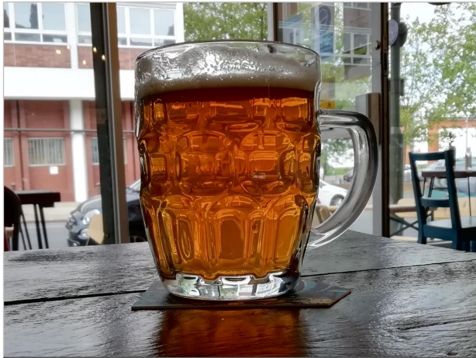
Beerblefish, Pan Galactic Pale Ale, 4.6% At Three Hounds Beer Co on 2 nd June 2021