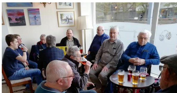
Some of the members present at the branch social held at the pub on 16 th October

"The new West Wickham Real Ale Way is bright and airy and situated in an excellent position. It was clearly very popular, with many coming in on the opening day to sample the excellent ales and wines. The only minor hiccup on the day was that most of the furniture was, stuck on the M25 in traffic.