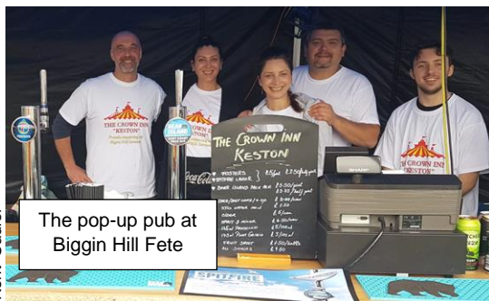
The pop-up pub at Biggin Hill Fete