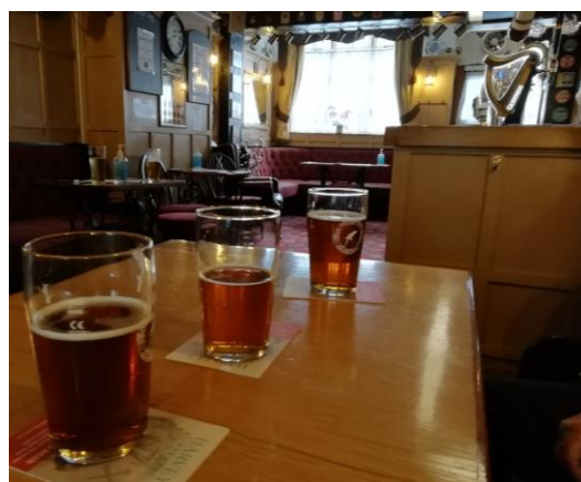
Clockwise from top left: Hope, Carshalton; Star & Garter, Bromley; Robin Hood & Little John, Bexley; Dog & Bell, Deptford