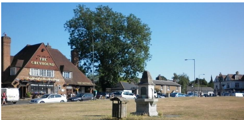
Keston Village. The Greyhound and the Fox Inn are both on the edge of the common.