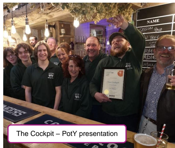
The Cockpit – PotY presentation