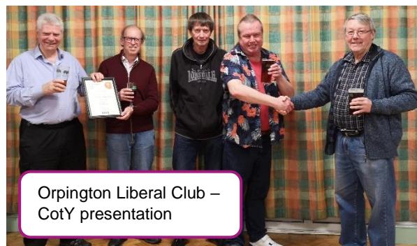
Orpington Liberal Club – CotY presentation