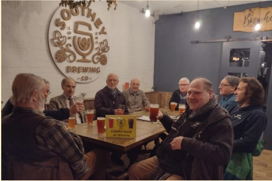
15 January – Brewery Tap, Southey