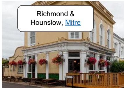
Richmond & Hounslow, Mitre