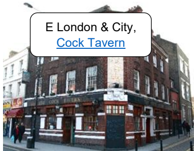
E London & City, Cock Tavern