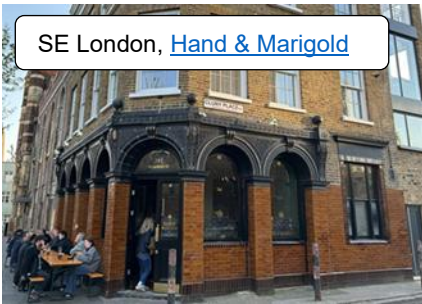
SE London, Hand & Marigold