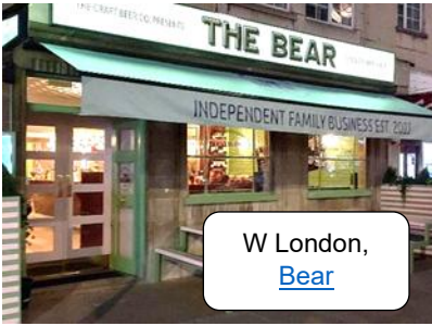
W London, Bear