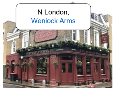
N London, Wenlock Arms