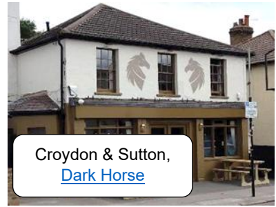
Croydon & Sutton, Dark Horse